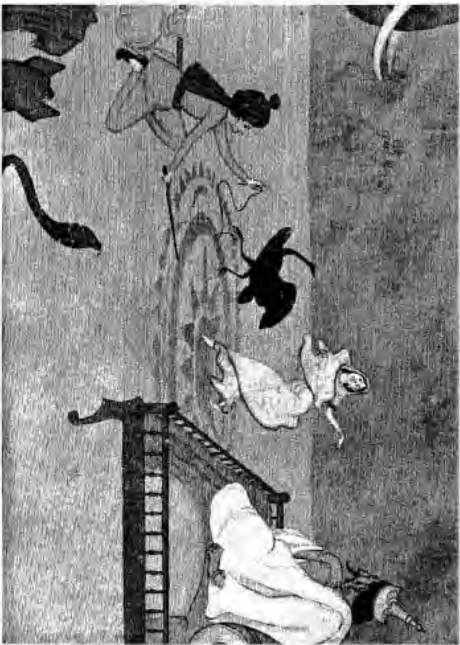
"The dance of the peacocks."